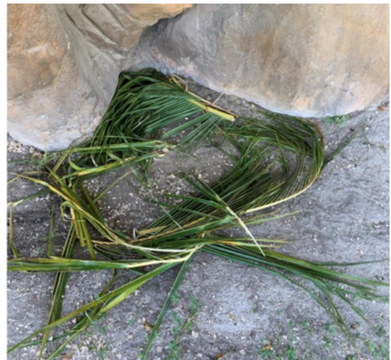
(Nest built by orangutan at Zoo Miami)

Materials: Blankets, sticks, leaves, or hay