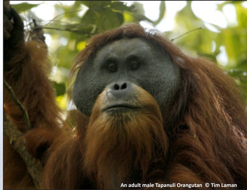
An adult male Tapanuli Orangutan

The Tapanuli orangutan was until recently regarded as the southernmost population of the Sumatran orangutan, Pongo abelii . However, based on detailed genetic, morphological, ecological, and behavioural research by Indonesian and foreign researchers, it has been discovered that the Tapanuli orangutan is taxonomically more closely related to the Bornean orangutan species, Pongo pygmaeus , and is in fact a separate species from both. Research also ancestral the Tapanuli orangutan is ancestral to all modern orangutan species.